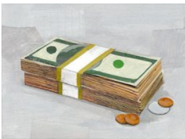
ILLUSTRATION: WARREN BOOTH

( http://fortunewallstreet.files.wordpress.com/2012/02/cash_coins.jpg ) Even in the U.S., where the wish for a stable currency is strong, the dollar has fallen a staggering 86% in value since 1965, when I took over management of Berkshire. It takes no less than $7 today to buy what $1 did at that time. Consequently, a tax-free institution would have needed 4.3% interest annually from bond investments over that period to simply maintain its purchasing power. Its managers would have been kidding themselves if they thought of any portion of that interest as "income."